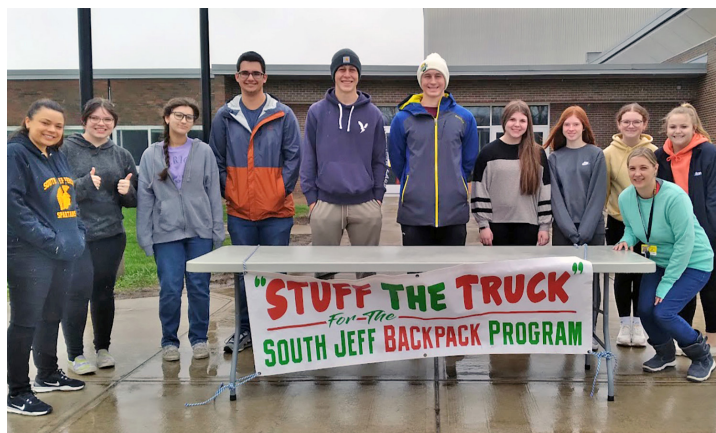
SOUTH JEFF BACKPACK PROGRAM: South Jefferson Central High School students celebrate a successful "Stuff the Truck" event to stock the school-based backpack program with food and other essential items. A $1,000 Community Fund grant helped purchase food from the Food Bank of Central New York to strengthen the program's food inventory for Six Town students and families in need.