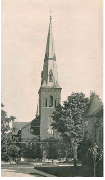
First Presbyterian Church of Watertown in the early 1900s. The original structure on Washington Street was dedicated on April 10, 1851. The church will celebrate its 175th anniversary next year.

Across Northern New York, some of the most prominent and recognizable historic properties are churches. Iconic landmarks such First Presbyterian Church add character, identity, and beauty to the local landscape and help link the generations together, and we are pleased to support this aspect of community betterment.