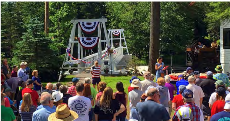
DEDICATION TO PRESERVATION: Large crowd gathered to celebrate the dedication ceremony for the restored Wanakena Footbridge.

On July 4, 2017, a dedication and celebration of the Wanakena Footbridge was held to thank donors, supporters, and volunteers devoted to the restoration project. This project is an example of the power of partnership between the Clifton-Fine Community Fund – born through the generosity of many citizens – and the Northern New York Community Foundation as a trusted and respected steward of the community fund.