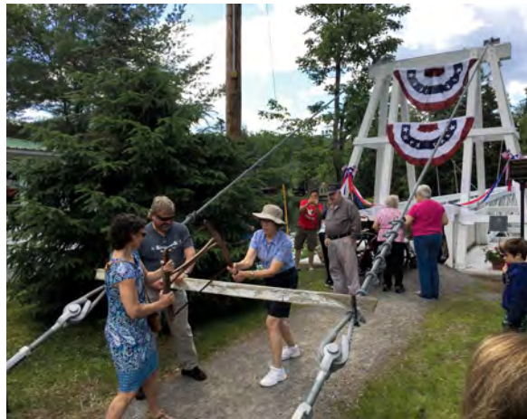
SIGNS OF PROGRESS: Above - An informational kiosk funded in part by the Clifton-Fine Community Fund. Left - Wanakena sign at the restored bridge. Right - The Wanakena Footbridge "ribbon cutting" of lumber recovered from the original bridge.

On July 4, 2017, a dedication and celebration of the Wanakena Footbridge was held to thank donors, supporters, and volunteers devoted to the restoration project. This project is an example of the power of partnership between the Clifton-Fine Community Fund – born through the generosity of many citizens – and the Northern New York Community Foundation as a trusted and respected steward of the community fund.