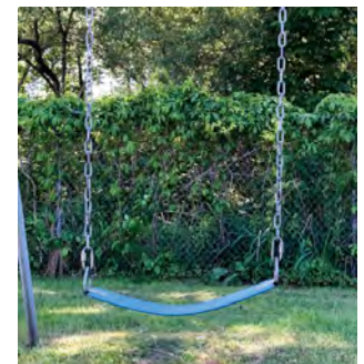
Pictured are the basketball backboards and hoops and swings funded by the Clifton-Fine Community Fund.

This project and improvements are a prime example of how a community fund can advance or help complete a vital community project. It is a prime example of community philanthropy and investment in practice.